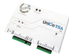
TELEDIF ITALIA Telephone